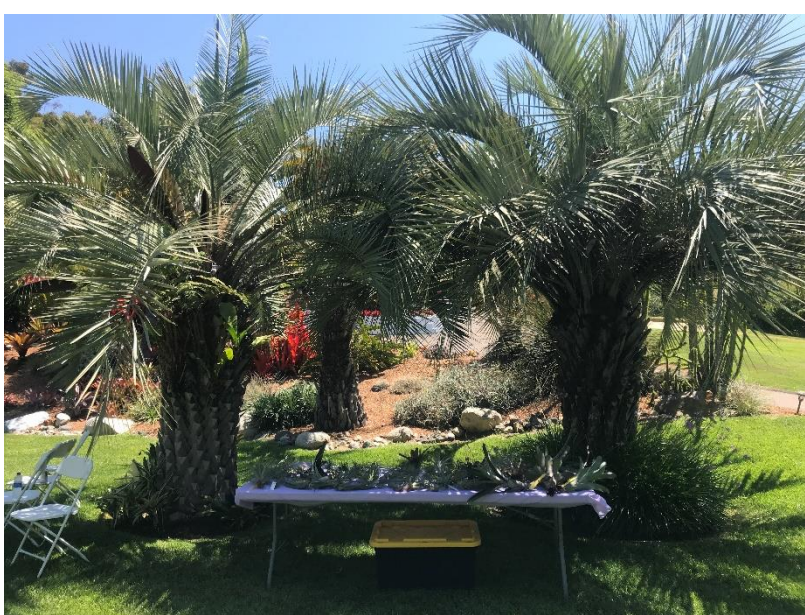
Left: Steve's sangria – delicious! Right: The plant table never looked as good as this, flanked by 2 regal Butia capitata palms. The garden is full of majestic palms, cycads and aloes. Bottom: Pam Hyatt and her fabulous garden.