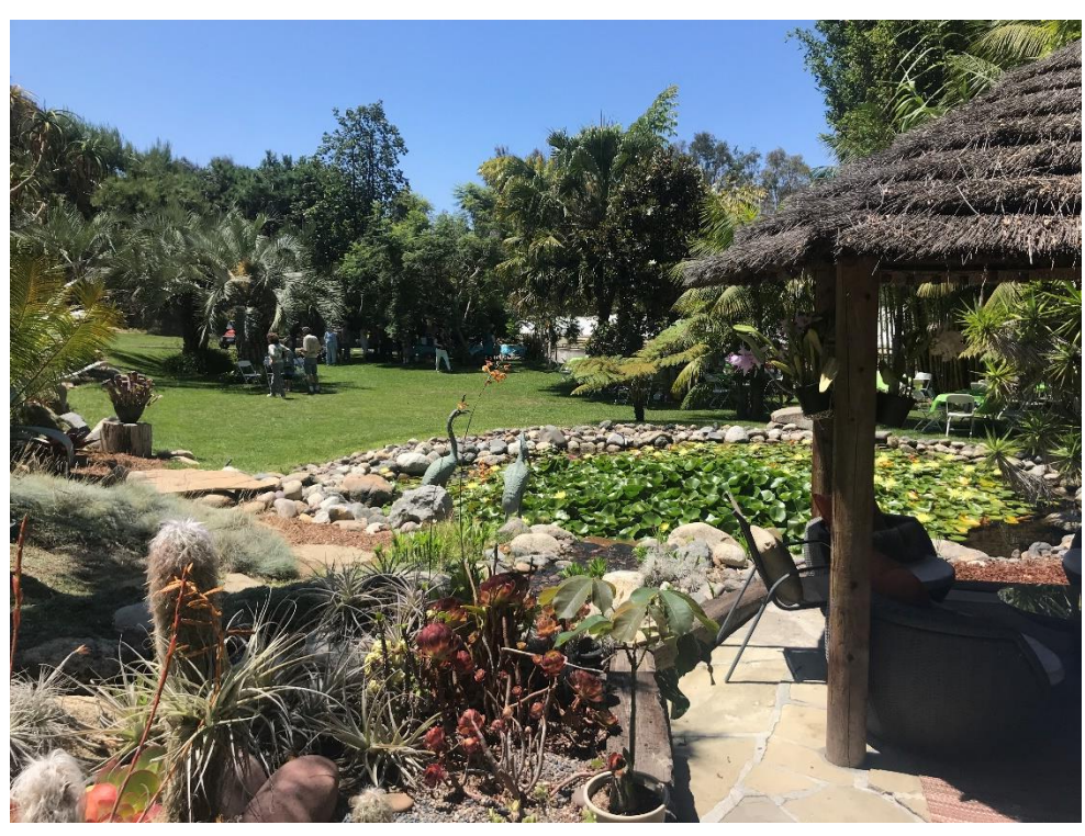
Two more shots of the August picnic in Pam Hyatt's garden.